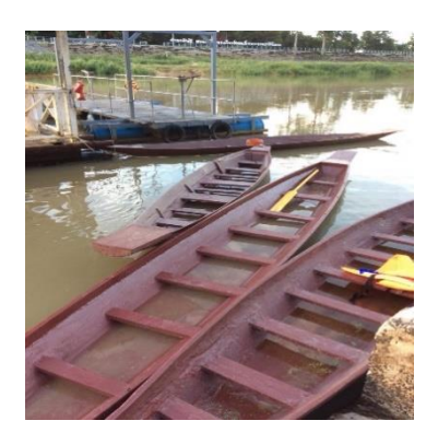
Figure 5: fisherman boat