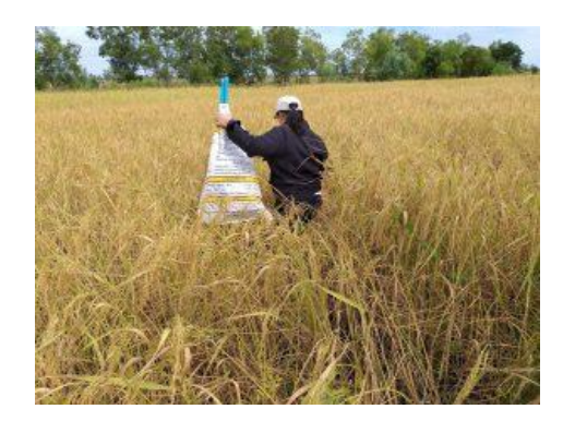
Figure1: rice field

The main occupation is farming in the Tung Kula subdistrict. Silk weaving and animal husbandry Cowboys make extra career. The majority of revenue comes from the sale of Hom Mali rice. Average yield of rice is about 450 kg / rai. The income of about 20,000 baht per household per rai. Overall, the economy of Tung Kula. Considered at a relatively low level. (Information in 2002) And the area of rice cultivation from the agricultural office in Tatum and Agriculture. Tung Kula subdistrict, the area of cultivation and rice field viewer Annual output produced per household. The number of households that fish is sold. And average daily income or monthly income during the fishing season.