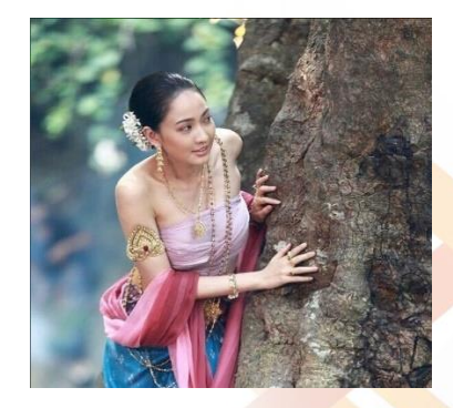
Figure 13: movie star silk decorated

Especially the Sompod or Sompad 'Sompod' is a sarong. There is a beautiful pattern which high silk fabric, it is called 'Silk handcraft' which produced high quality silk and was selected as the top product of Chumphon buri district, Surin province and exhibited at the product center of the Muang Thong Thani (OTOP with five stars), and became the heraldry of Dress in the TV movie about Naga. Later, earned a reputation and the fabric pattern. This reflects the natural and geographic resources of Tung Kula. It has a long history, especially as a valuable natural resource for the life of the people in the community. Four basic needs, the rice is the main food and farming. Mulberry growing for silk is used as a material for weaving, as clothing and as an expensive item because of the ancient patterns of cloth used in the royal court.