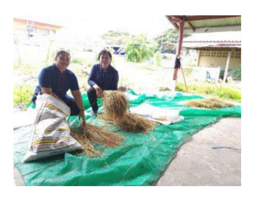
Figure 2: rice productions