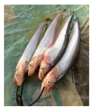
Figure 8: fish from Mun river