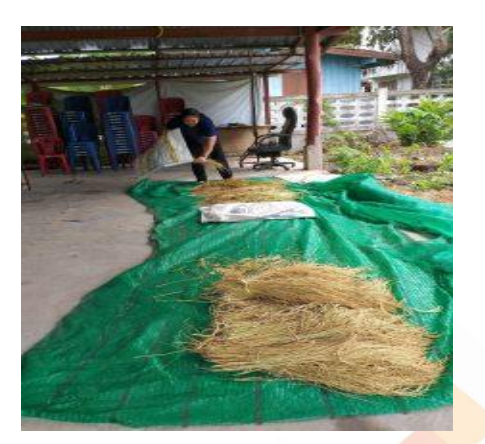
Figure 3: rice farmer