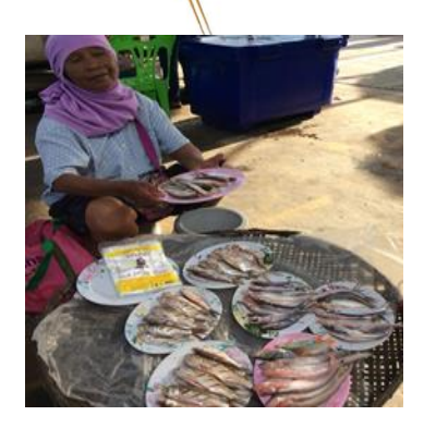
Figure 6: fish seller