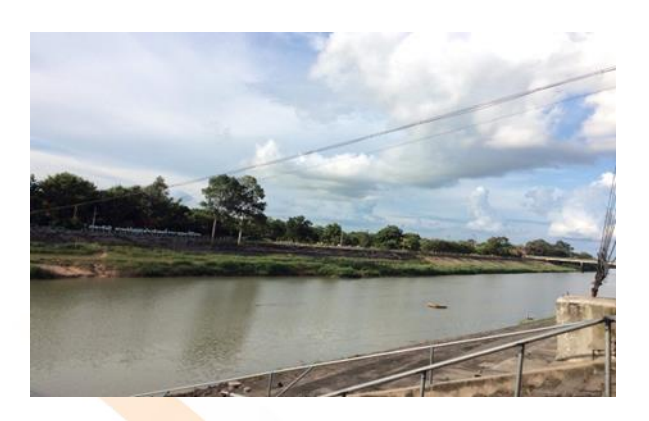
Figure 9: Mun river

Males mainly do hard labor as a fisherman, a machine and equipment's were used for catching fish and vehicles such as boats in Mun river at Tatum district and females do light labor, fresh fish seller including the care of children or making meals.