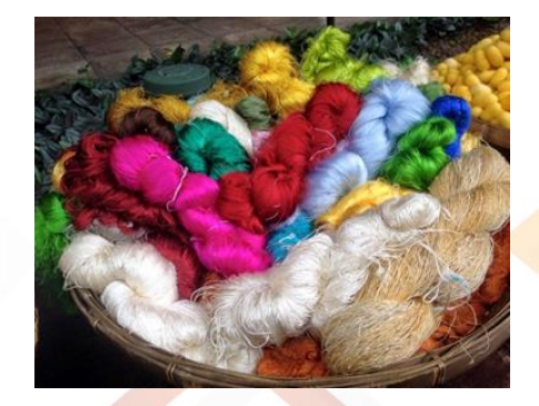
Figure 14: silk textile