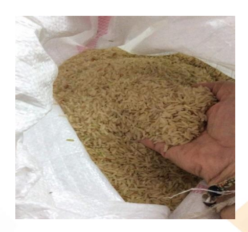
Figure 4: rice stock